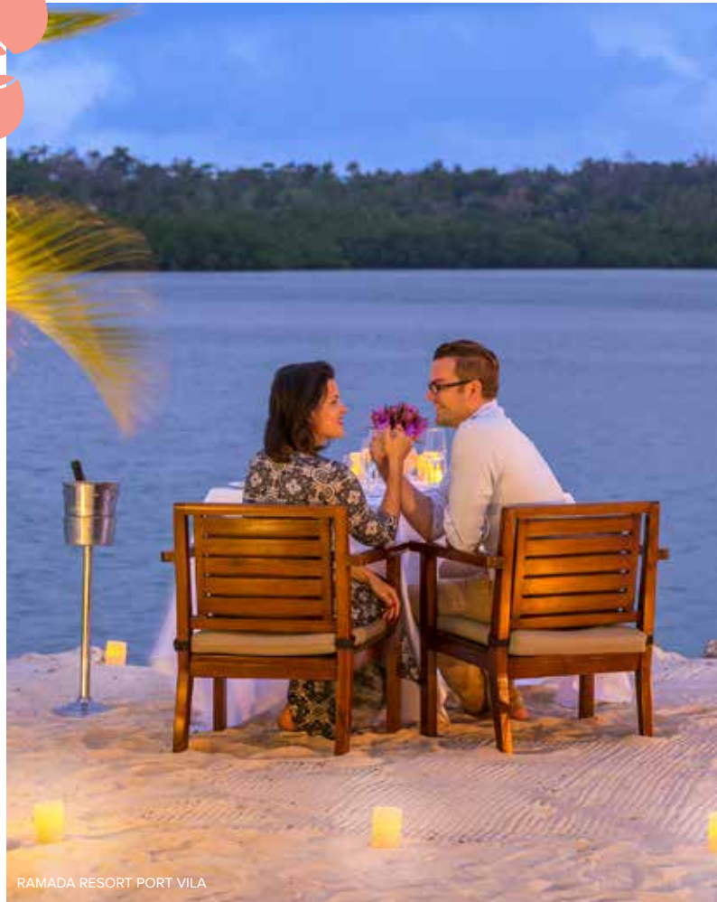
RAMADA RESORT PORT VILA

The Holiday Inn Resort Vanuatu 'Tugeta' Wedding Package includes a warrior escort on a traditionally decorated wedding canoe, a personal wedding coordinator and a minister or celebrant with all the necessary documentation. The happy couple and up to 20 guests can also enjoy an hour of celebratory canapes and drinks as part of the deal. In addition to the wedding package, Holiday Inn offers guests and brides specials at its 'Namele Day Spa' which features indulgent massages in its lagoon-side massage cabana.