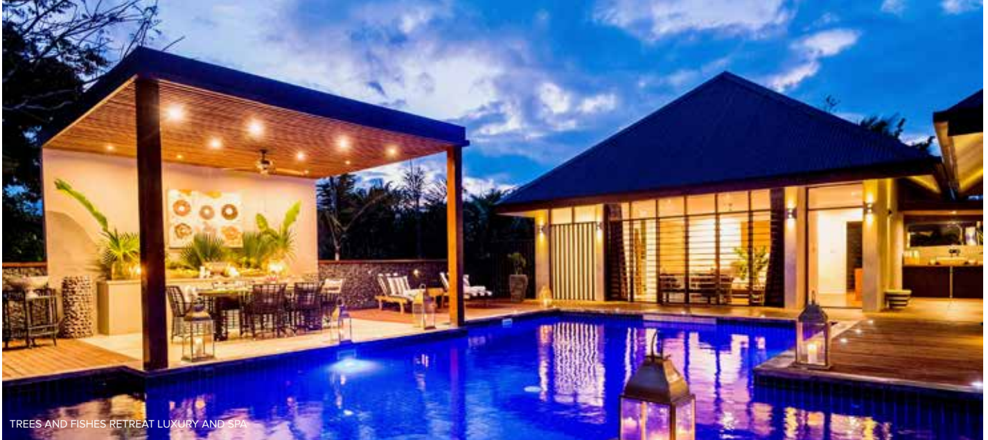
TREES AND FISHES RETREAT LUXURY AND SPA

Trees and Fishes accommodates a maximum of 20 people, making the resort an ideal spot for a couple wanting peace and privacy. Those in search of island glamour and decadence can stay in one of four suites. Each with a 96 square metre floor area and all featuring outdoor garden baths. They have been specially designed to provide couples with indoor privacy and access to a shared sheltered outdoor courtyard, where a large and inviting swimming pool adorns its centre.