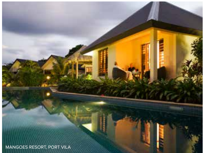
MANGOES RESORT, PORT VILA