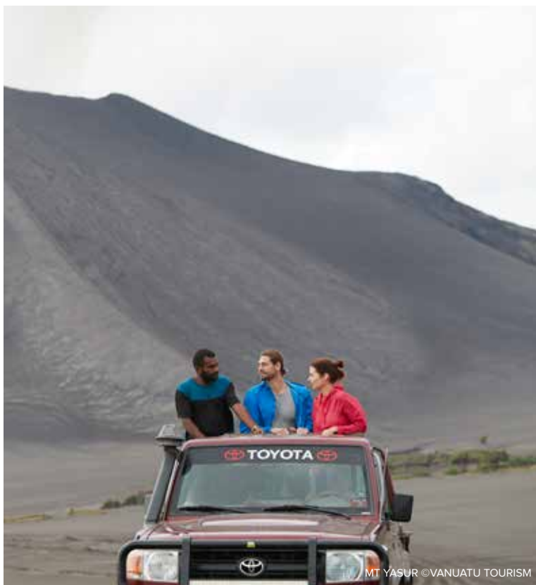
MT YASUR

Santo also has arguably Vanuatu's most beautiful beach, aptly named, Champagne Beach. Picture warm, translucent water, powdery white sand and offshore islands in the distance, all surrounded by dark green tropical rainforest. It's magic. And if it were anywhere else in the world, it would be crammed with resorts, shops, cafés, restaurants and thousands of people. But in Santo, the crowd factor is non-existent – except during cruise ship visits – which a couple should plan to avoid anyway.