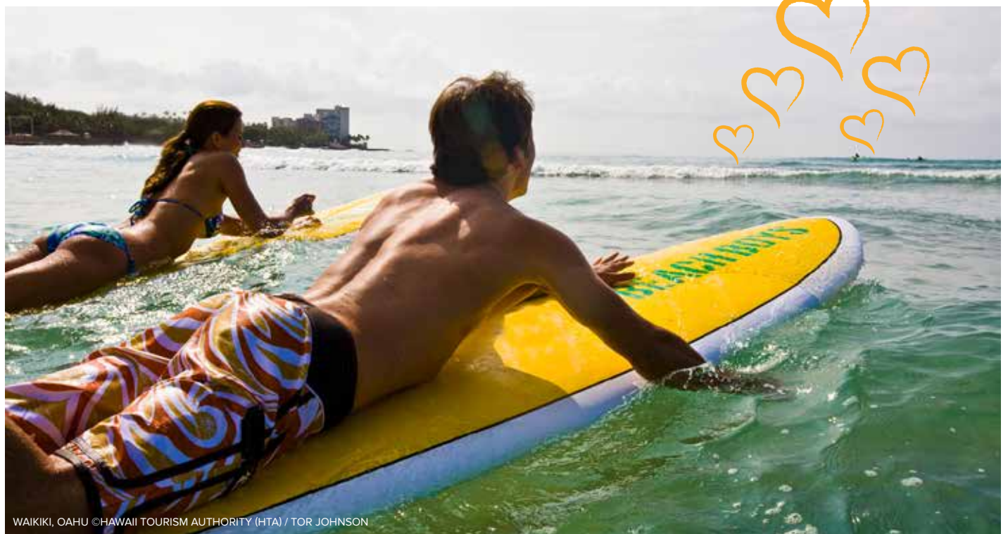
WAIKIKI, OAHU