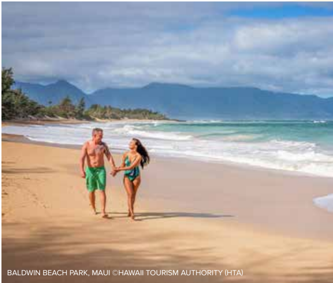
BALDWIN BEACH PARK, MAUI