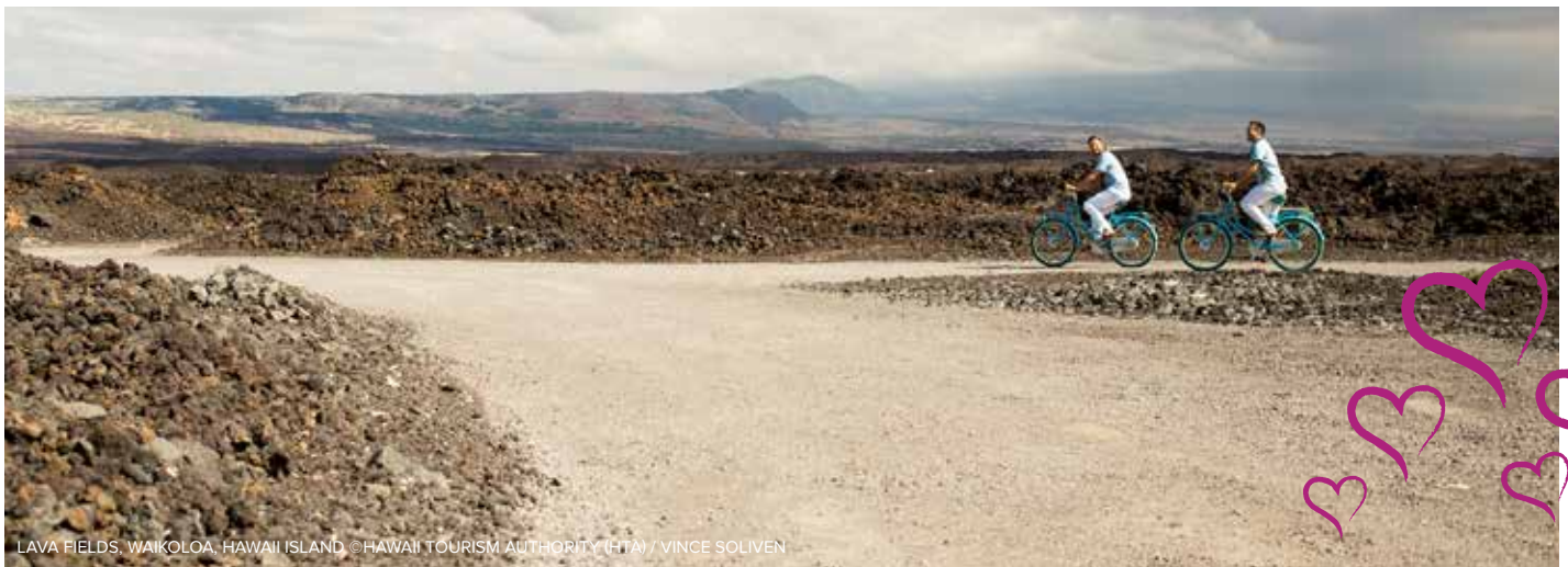
LAVA FIELDS, WAIKOLOA, HAWAII ISLAND

Built in 1965 on a stunning stretch of pristine white sand, Hawaii's first resort, the Mauna Kea Beach Hotel, has stood the test of time. Its blend of sports and beach activities, handcrafted cocktails and dizzying ocean views will keep couples coming back for many more years to come.