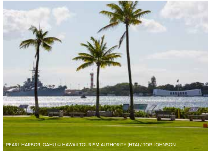
PEARL HARBOR, OAHU

Situated in the heart of Kalakaua Avenue, ‘Alohilani Resort has become one of Waikiki’s finest following a multi-million-dollar transformation. The Swell Bar and Lounge is a cool spot to have a drink, with its infinity pool, cabanas, driftwood sculptures, lanterns and glowing fire pits. And when the sun decides to call it a day, it’s time for live music and cocktails. For an intimate romantic dinner, couples will want to try one of the resort’s two spectacular Japanese restaurants – both are run by esteemed ‘Iron Chef’ Masaharu Morimoto