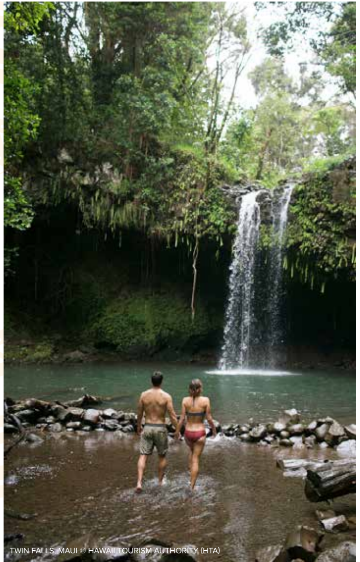
TWIN FALLS, MAUI

Maui has some brilliant surfing spots and Lahaina Reefs, on the west coast, is perfect for riders of all levels. Honolua Bay, on the other