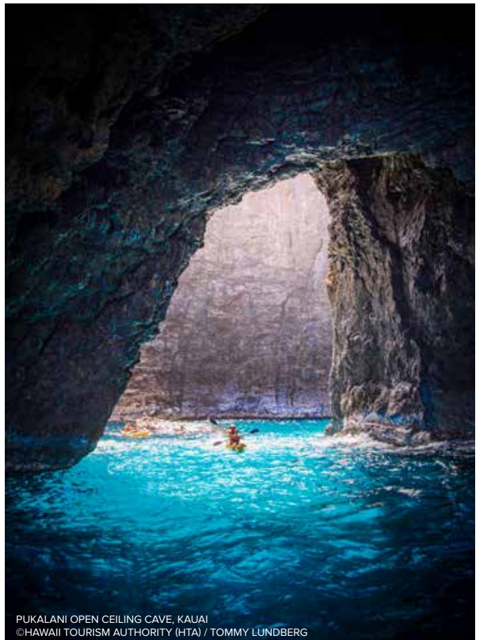
PUKALANI OPEN CEILING CAVE, KAUAI