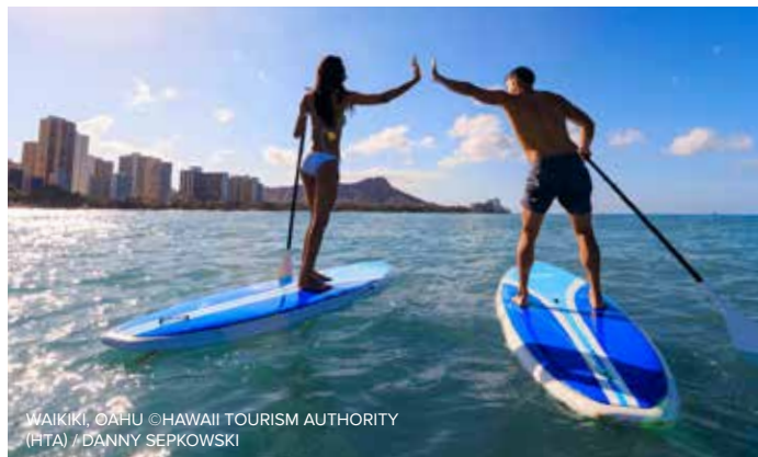
WAIKIKI, OAHU