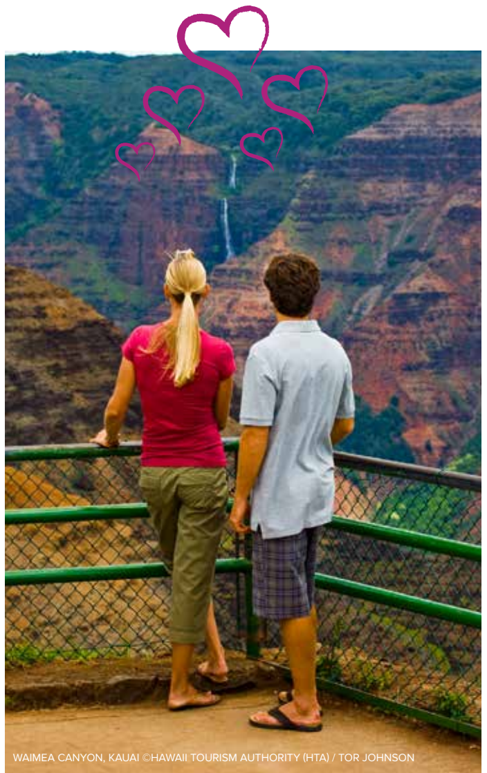
WAIMEA CANYON, KAUAI