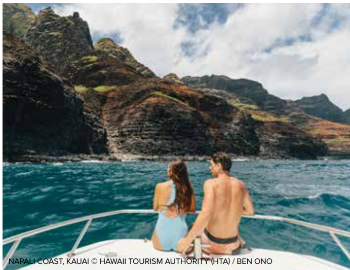
NAPALI COAST, KAUAI

Stay on the sunny south shore sands of Poipu at Grand Hyatt Kauai Resort and Spa, where lush tropical gardens, luxurious pools, ocean view dining, a tranquil spa and championship golf course will soothe your souls. This resort is thus the perfect place for a honeymoon. Or a wedding – if you're looking to tie the knot – with all the planning tools available along with stunning venues to make your special day unforgettable.