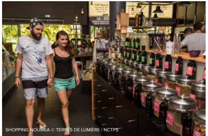
SHOPPING NOUMÉA