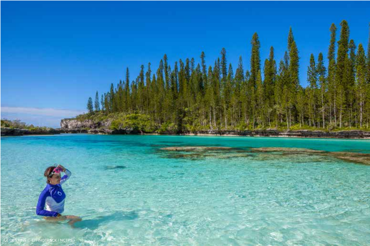
ILÉ DES PINS