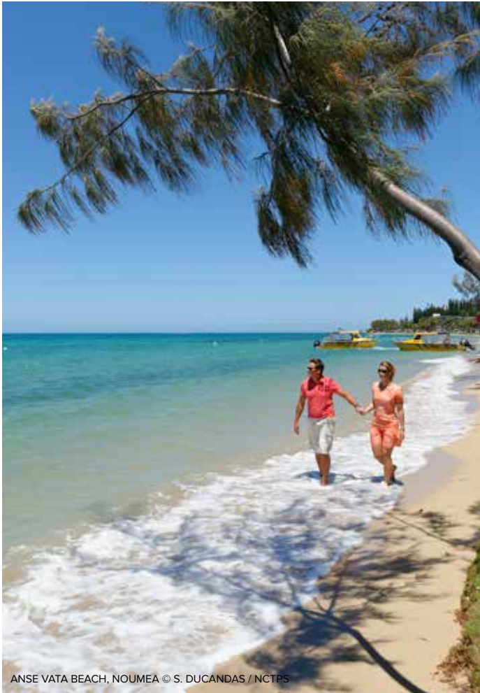
ANSE VATA BEACH, NOUMÉA