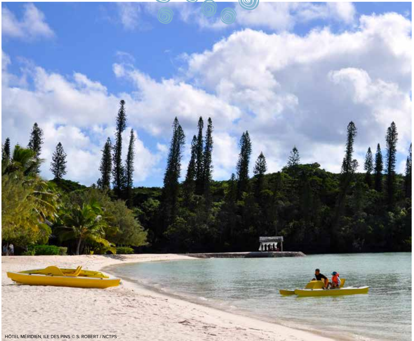
HÔTEL MÉRIDIDIEN, ILE DES PINS