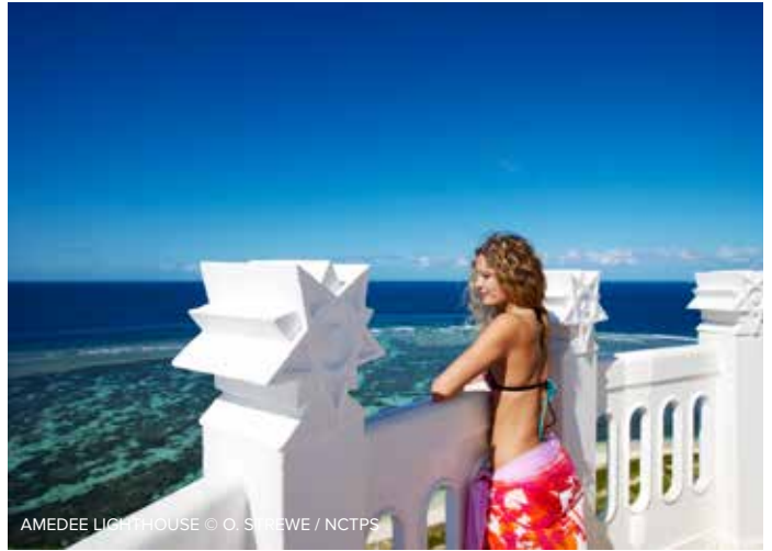
AMEDEE LIGHTHOUSE