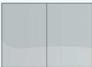
Double Page Spread

Full design and advertising services available POA